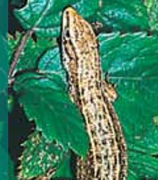
Cornwall Wildlife Trust / JB &amp; S Bottomley