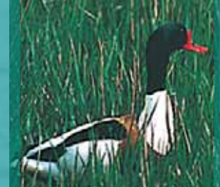
RSPB / C H Gomersall