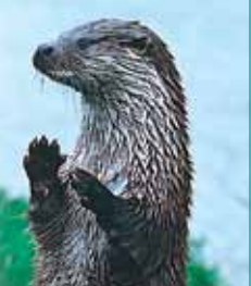
Cornwall Wildlife Trust / S Hutchings