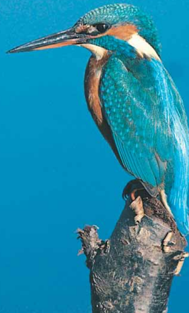
Cornwall Wildlife Trust / JB &amp; S Bottomley